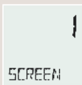
E.g.: The screen in the office