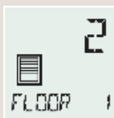
E.g.: The roller shutters on the first floor