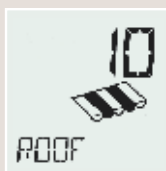
E.g.: The awning on the roof balcony