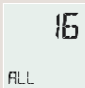
E.g.: All products in the house